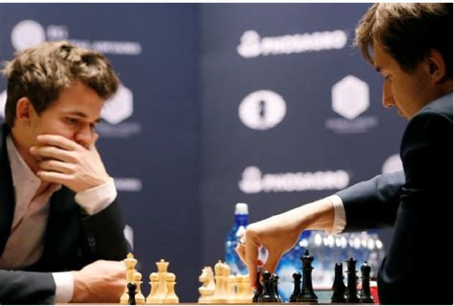
World chess championship tie break rules.